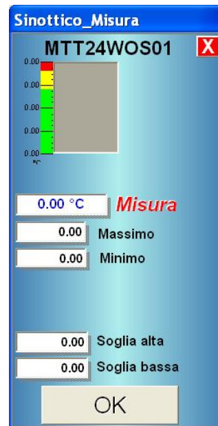
A pop-up window parameterized with dynamic custom set-point field display.

The plant system also has a Client station connected in ethernet network to the Server PC managing the plant. The Client station permits personnel to manage and monitor processes locally without going to the main control room to do so. The Client station, dislocated in the system, provides the same functions found on the Server accept those relating to data reserved for ARPAT's attention only.